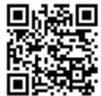
Photo Dates: Thursday (2:00-8:30pm), Friday (2:00-8:30pm), and Saturday (10:00am-4:00pm), June 12, 13, and 14.

Schedule your photography appointment online! Just scan the QR code to the right -or- go to www.ucdir.com and click the "Photography Session Sign-Up" button. Enter mn565 in the "Church Code" field. Enter photos in the "Church Password" field. Online signup is not available on weekends so that we can have paper sign-up at church Saturdays and Sundays. The schedules will fill up quickly, so sign up now to get the time that works best for you!