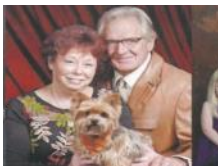
Photo Days for New Directory

Each Wednesday (BBQ: 5:15pm, Service: 6:00pm)