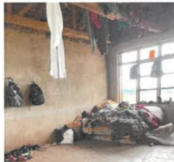
Sleeping in classroom at Makwema