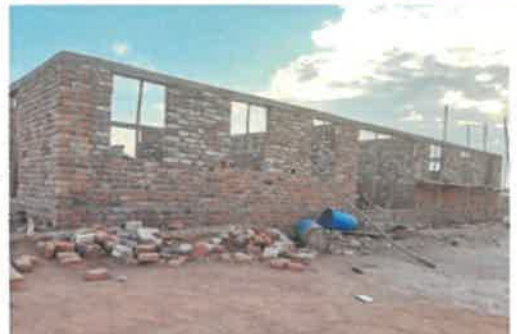
New dorm under construction (November 2022)

If you're interested in tracking progress of the U of M group please visit our blog after December 29 th at https://z.umn.edu/TanzaniaBlog2022-23 . Please also mark your calendars for the evening of February 28, 2023, to attend student presentations at the U of M covering their trip and system designs.